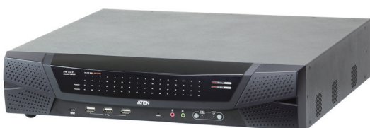
KN8164V Front View