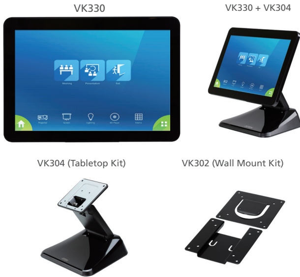
The Touch Panel VK330, the Tabletop Kit VK304 and the Wall Mount Kit VK302 are sold separately.