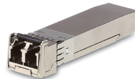
VM7584K2/VM8584K2 SFP+ Duplex SM Transceivers (10 Gbps/10km, blue)