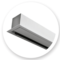
CLEAN AESTHETIC INSTALLATION