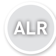
MOTORIZED PARALLAX ALR