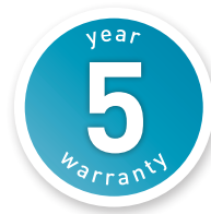
5 YEAR WARRANTY