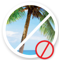
16K READY HD PROGRESSIVE