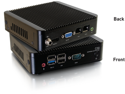
29977 Network Controller for HDMI over IP