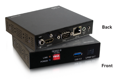
29976 HDMI over IP Decoder - 4K 60Hz