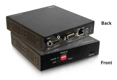
29975 HDMI over IP Encoder - 4K 30Hz